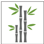
Fine-grained, 100% natural bamboo