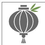
Excellent shrink and swell rate