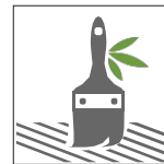
Perfect for coating