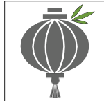
Excellent shrink and swell rate