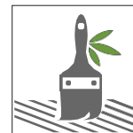
Perfect for coating