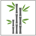
Fine-grained, 100% natural bamboo